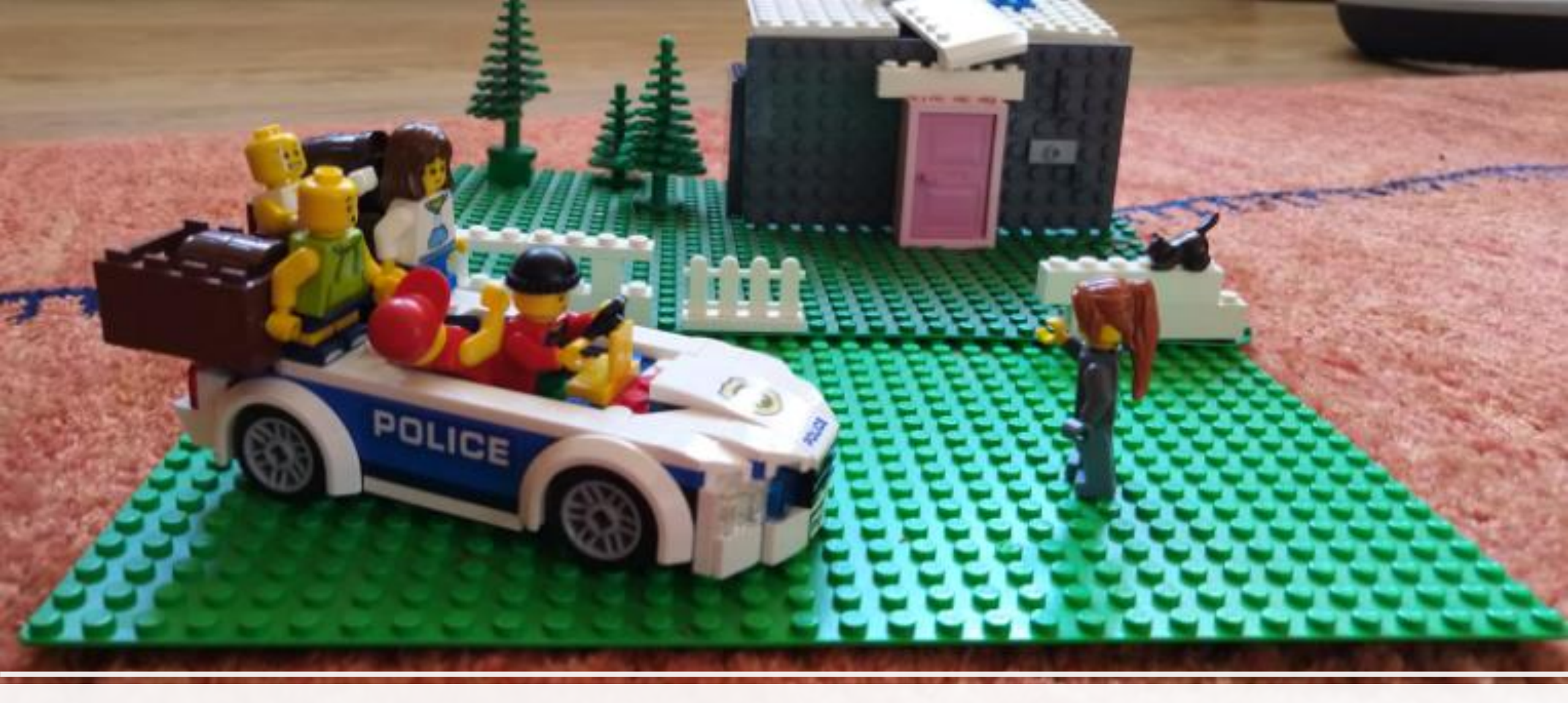
#3 Our new home for the season.