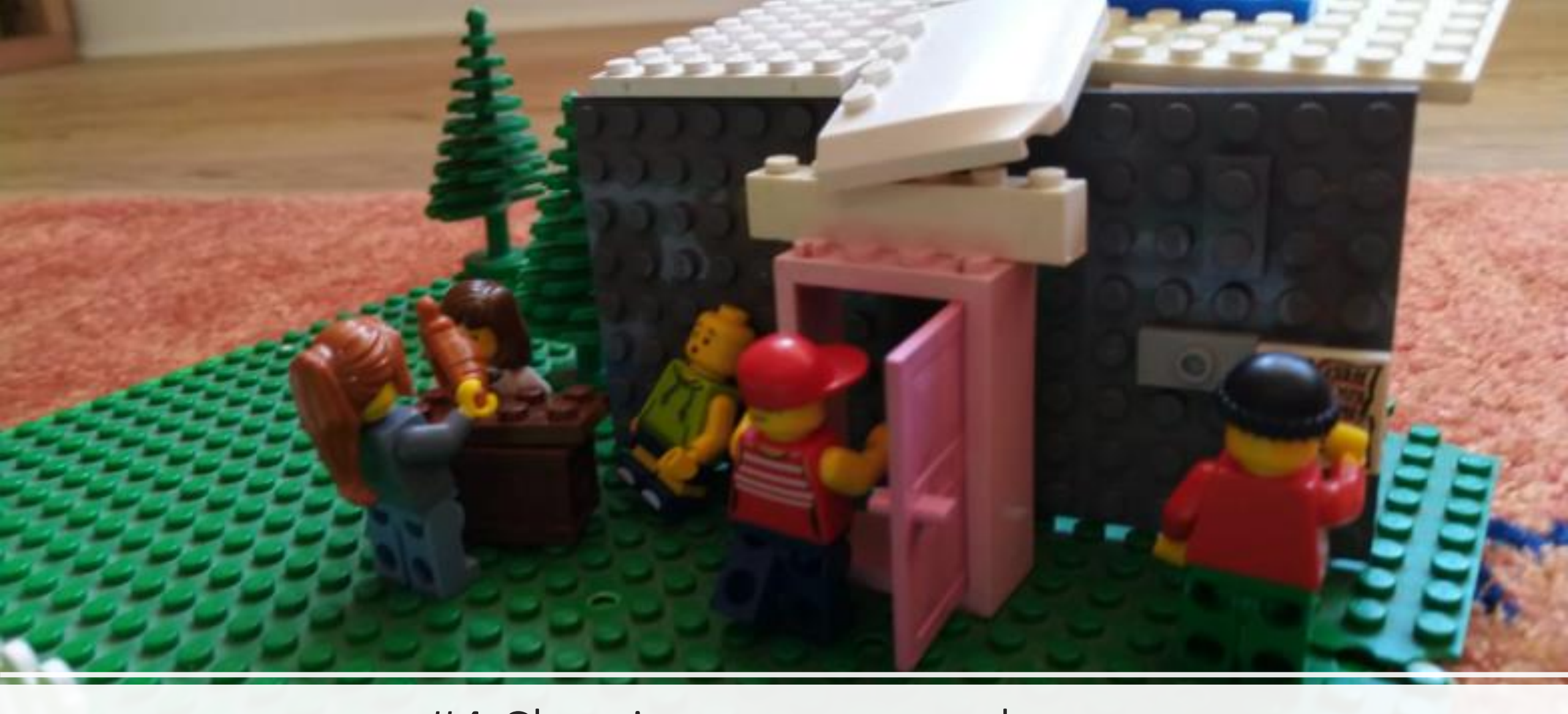
#4 Cleaning up our new home.