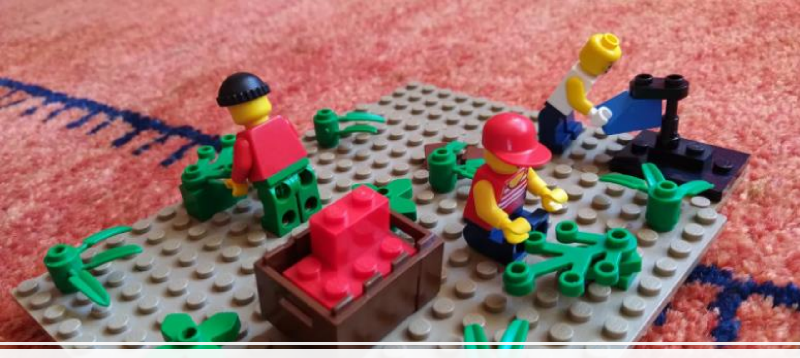
#6 The first day of our new work. It's sooo hot.