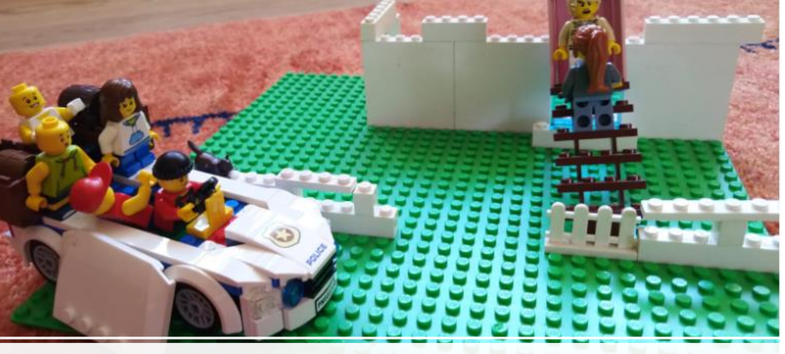
#2 Mum ask's a farmer, if he needs more fruidpickers.