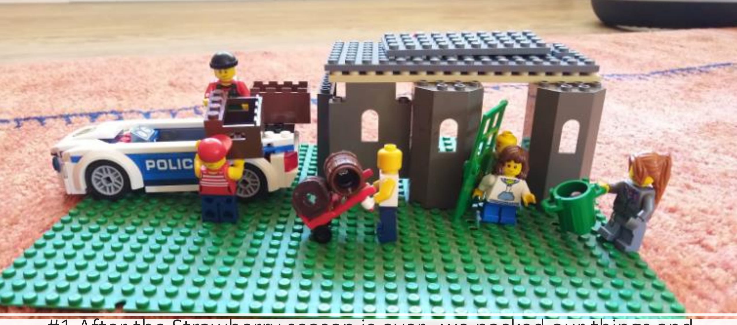
#1 After the Strawberry season is over, we packed our things and went on to search for a new job as fruitpicker.